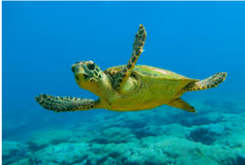
Turtle Sanctuary visit on Iztuzu Beach