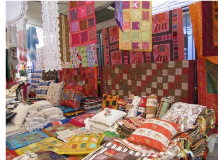
Markets in Dalyan