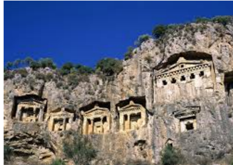
Ancient Tombs The impressive ancient Lycian ancient tombs in Dalyan